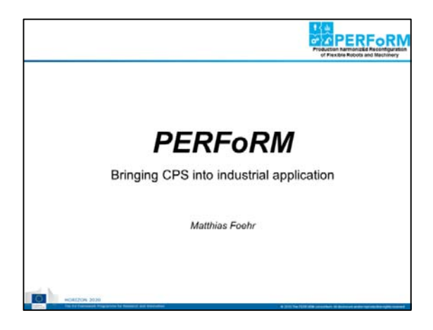
Figure 2: Title Page of the General Presentation

To have a common way of presenting PERFoRM's goals and ideas to a wide audience, a Microsoft PowerPoint presentation has been created to be used by partners at conferences and other dissemination events.