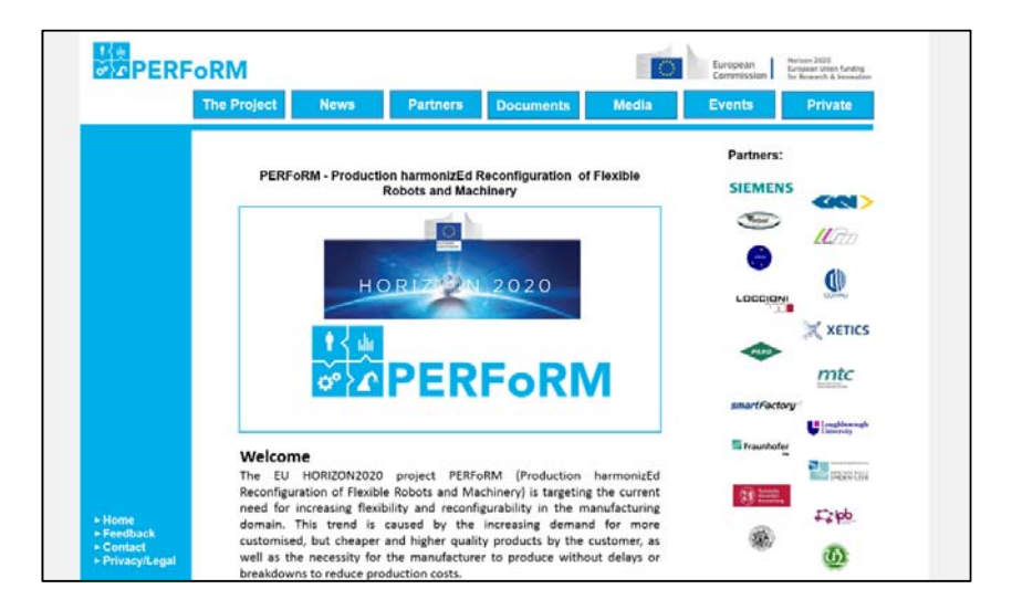
Figure 1: Main Frame of the PERFoRM Website

On the main frame of the project's Website, a short introduction and description of the goals of the project can be found alongside the project's logo and the logos of all partners. Also the latest news is shown. Via the menu in the top, the user can reach the following sub-pages to access additional information: